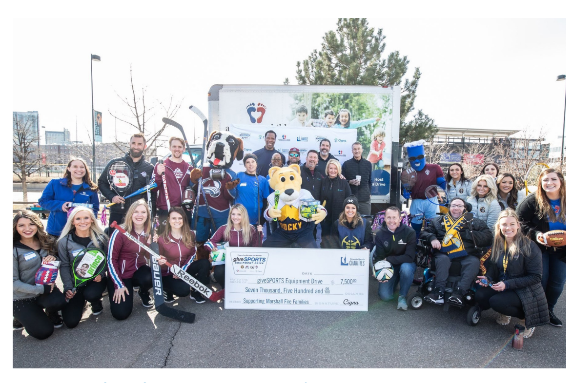
Kroenke Sports Charities executed a variety of programs and community initiatives to fulfill our mission statement.